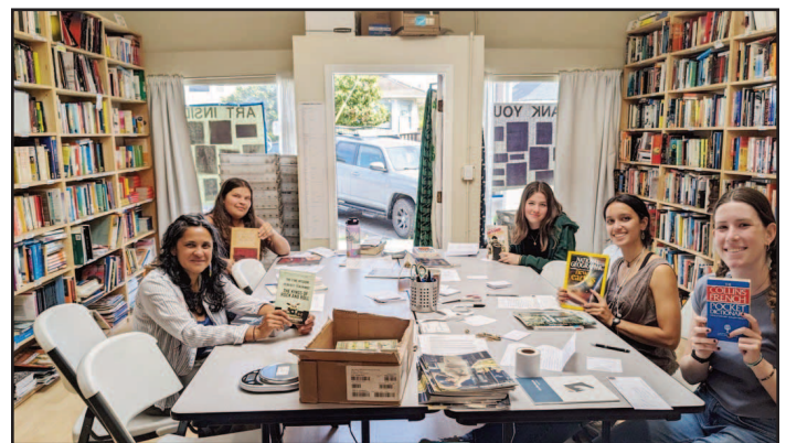
Berkeley High students in a book selection session May 2024

Since September 2023 volunteers from the Prisoners' Literature Project have been buying hundreds of books from FOPAL and collecting more during FOPAL's Sunday afternoon free shopping period for nonprofits.